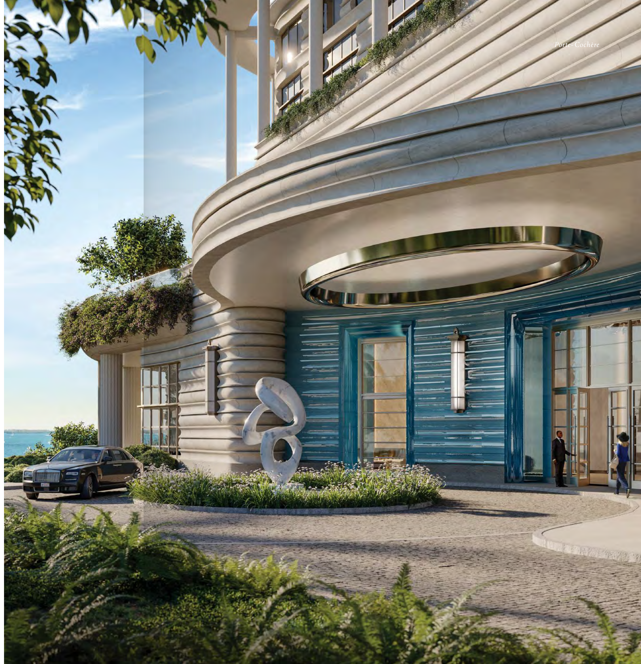
Robert A.M. Stern Design Architect

“When you’re talking about building a residence, you’re talking about dreams.”