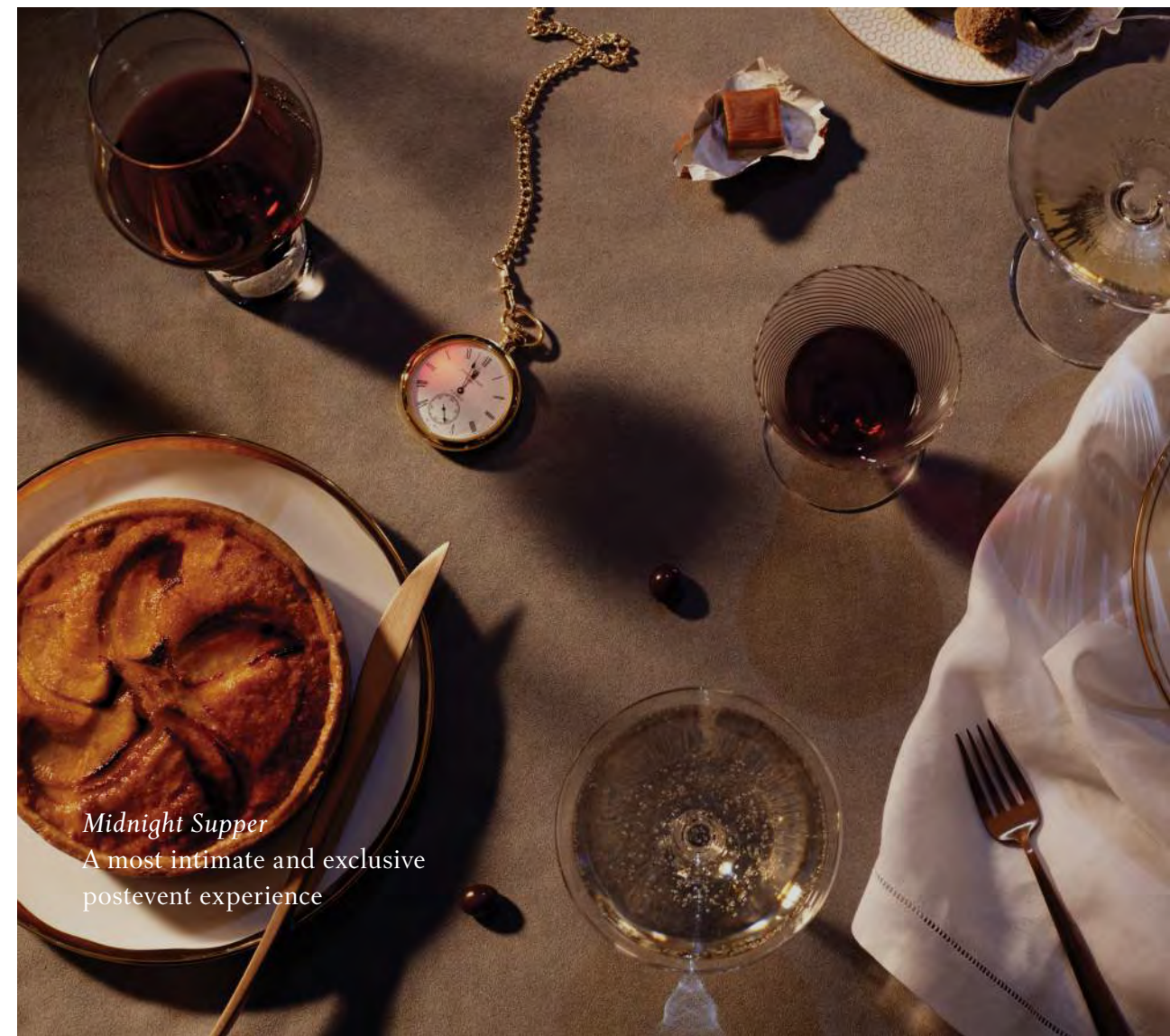
Midnight Supper A most intimate and exclusive postevent experience