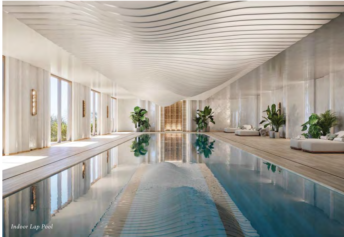
Indoor Lap Pool